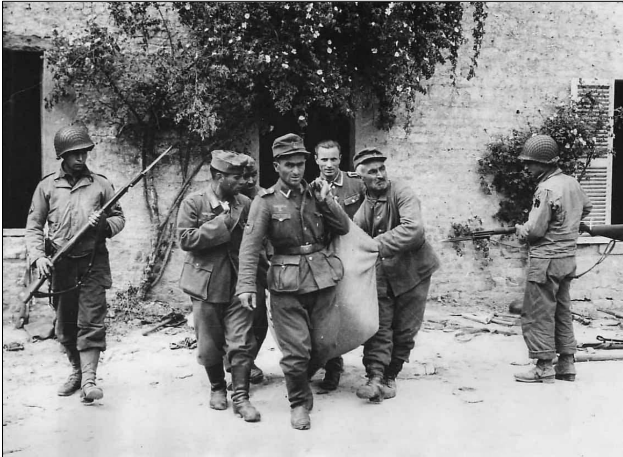
Georgian POWs in Cherbourg