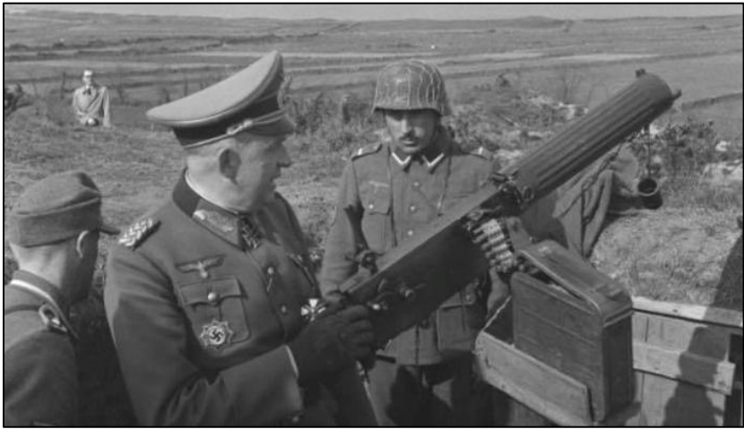
Georgian btl 795 during inspection early 1944