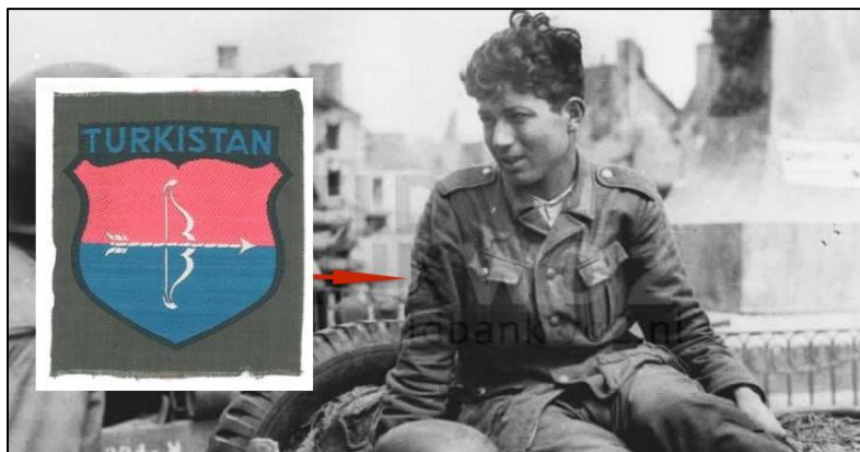
A member of Ost 627 surrenders near Saint Lo

43 regulations showing Cossack tab, Georgian/Turkic collar tabs, & ROA collar tabs & rank. While phased out in April 44 the ranks stayed the same & "Not in good standing" units still depict rank on shoulder boards in the same manner.