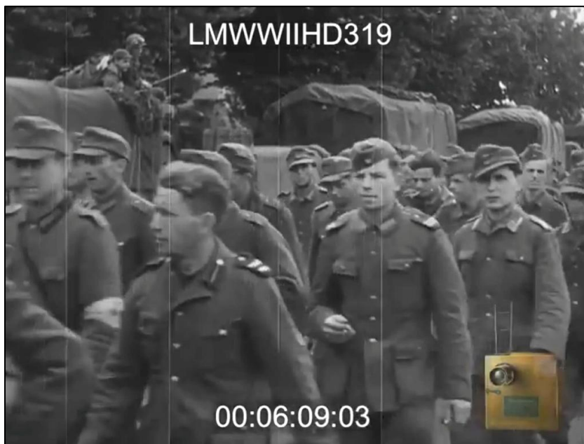
Ost 561 surrendering in Cherbourg with a wide variety of Russian foreign insignia