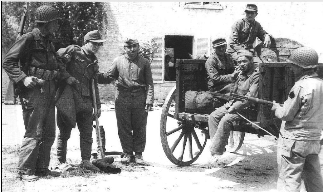
Près de Sainte-Marie-du-Mont, ces Géorgiens du 795 e bataillon d'Osttruppen viennent de se rendre aux Américains