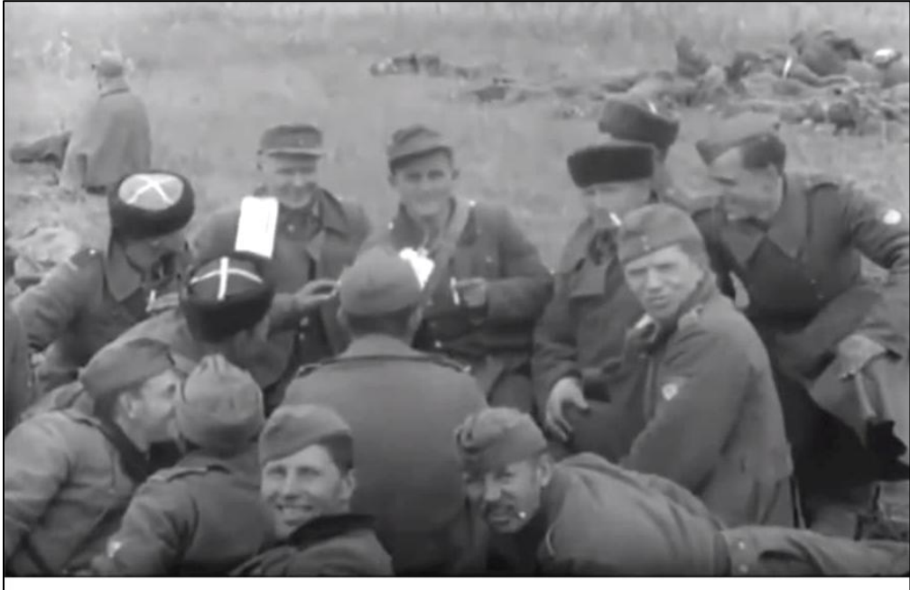
Members of Russ btl 635 in a POW camp near Carentan