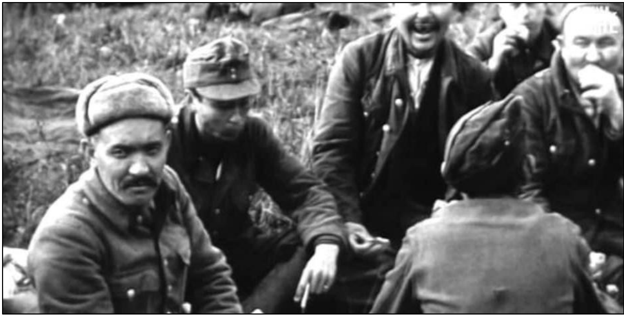
Ost POWs in Normandy