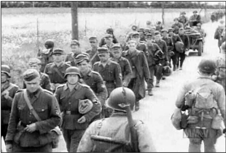
Russian personnel of Ost 439 surrendering near Point Du hoc