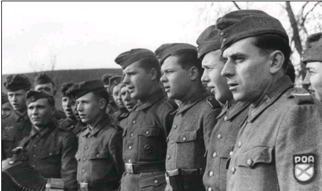
Unknown Russian Unit: April 44, Northern France

PPS43 & M44 Mosin Nagant, these weapons were just making their way into the Soviet army by June 1944 and were not wide spread enough to have made it into captured German stocks. And will not be allowed for this impression. Anachronistic weapons and Spanish or Swedish mausers will also not be allowed.