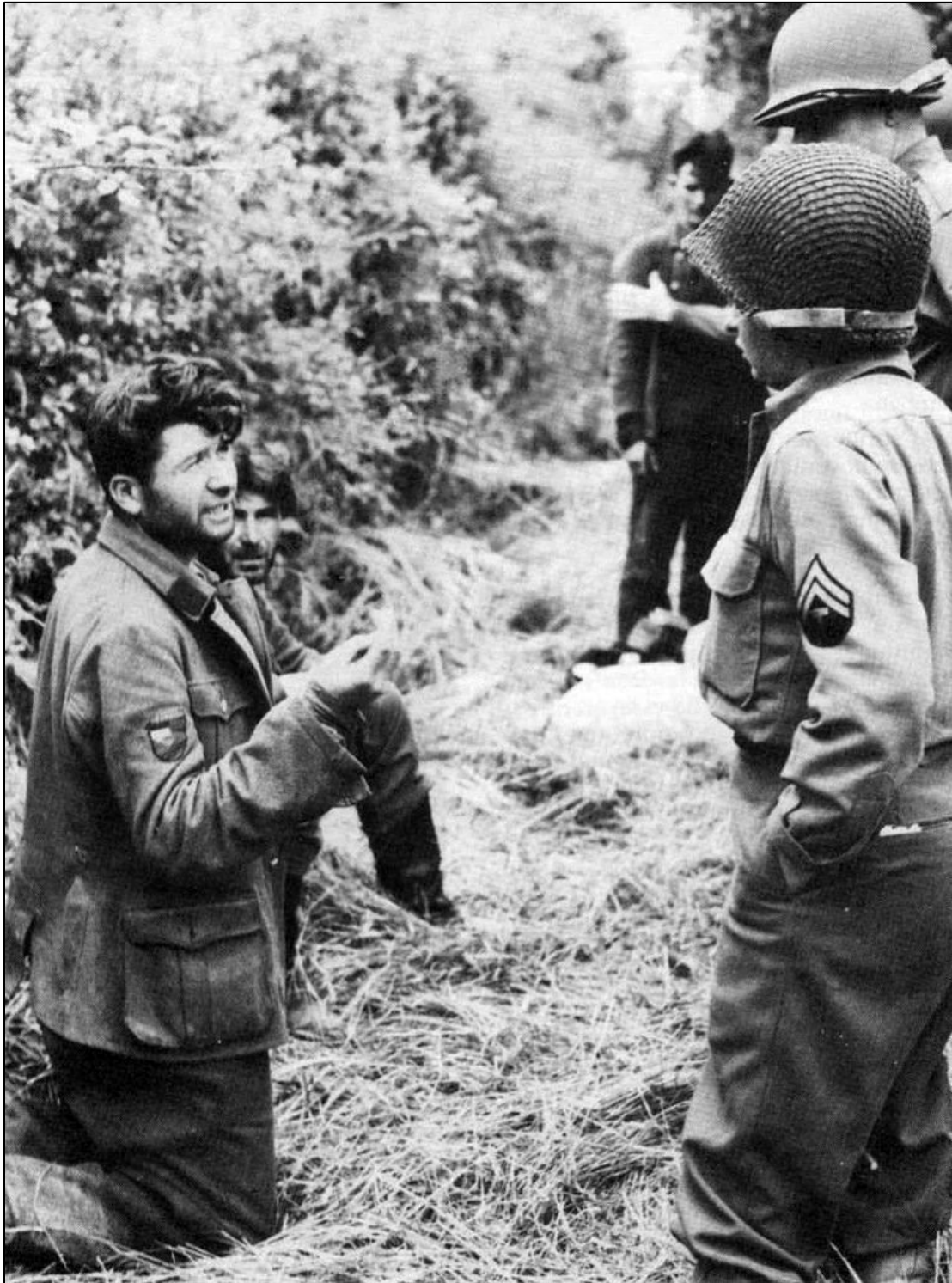
Georgian POW near Cherbourg