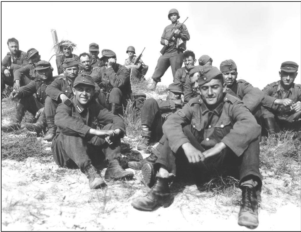
Ost 795 and a member of Ost 561 (ROA collar tabs) sit on Utah Beach after capture