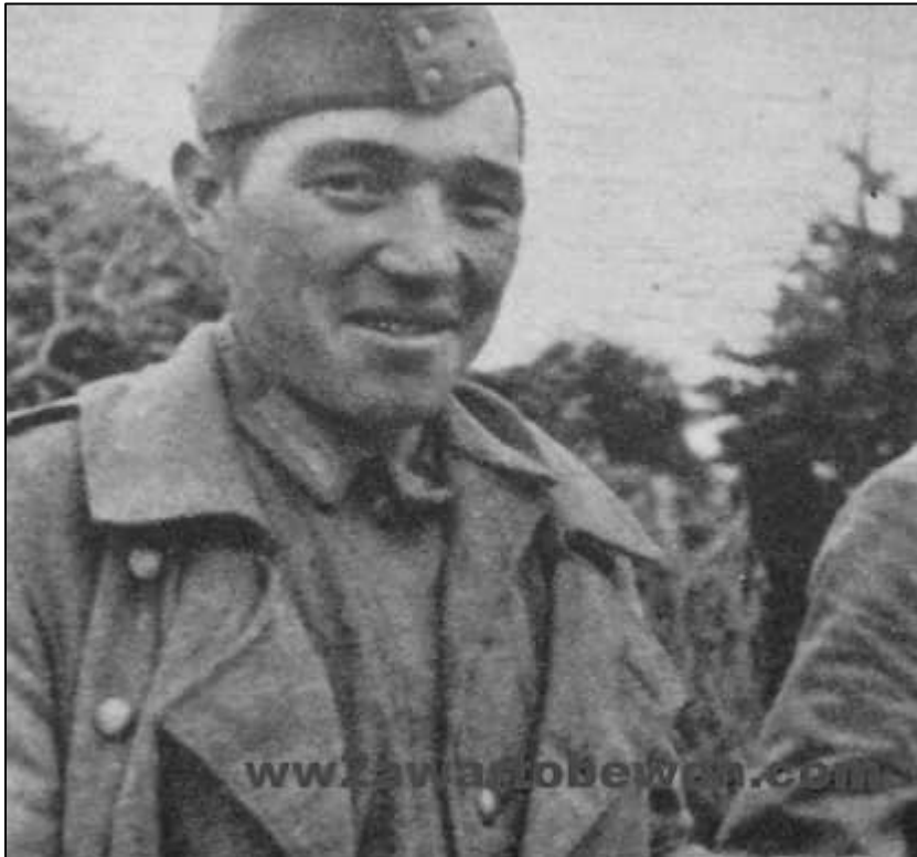
Ost 649 soldier writing a pamphlet to convince his unit to surrender June 1944