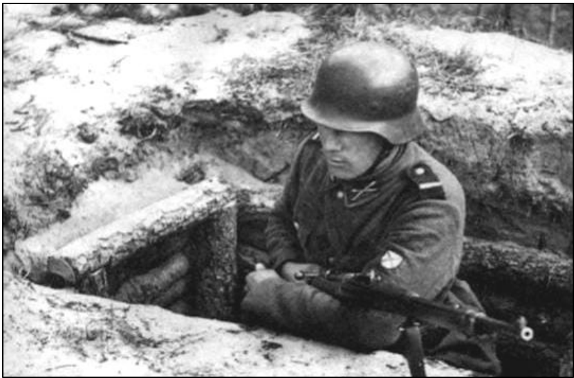
Cossack 360 Yefrietor armed with Gew 98 Early 1944